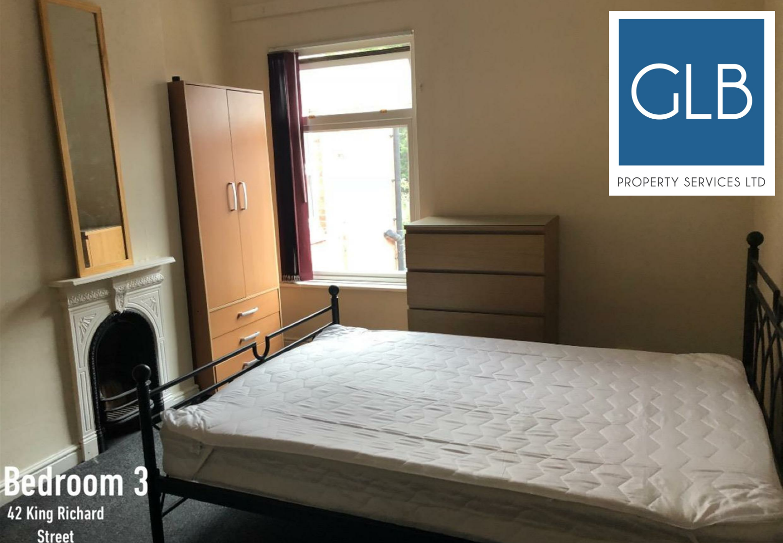
Bedroom 3 42 King Richard Street

42 King Richard Street , Coventry, CV2 4FX