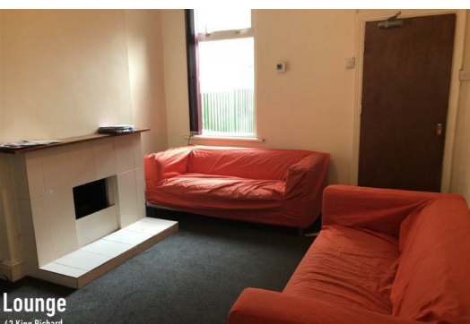
Lounge 42 King Richard

£1,600.00 per calendar month. Including Bills (gas, water & electric)