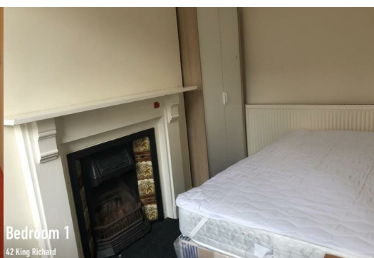
Bedroom 1 42 King Richard