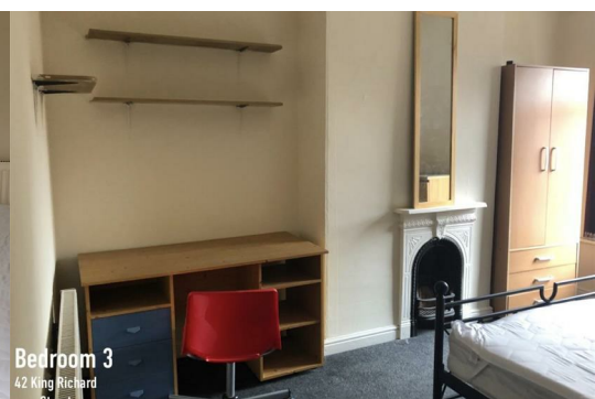
Bedroom 3 42 King Richard